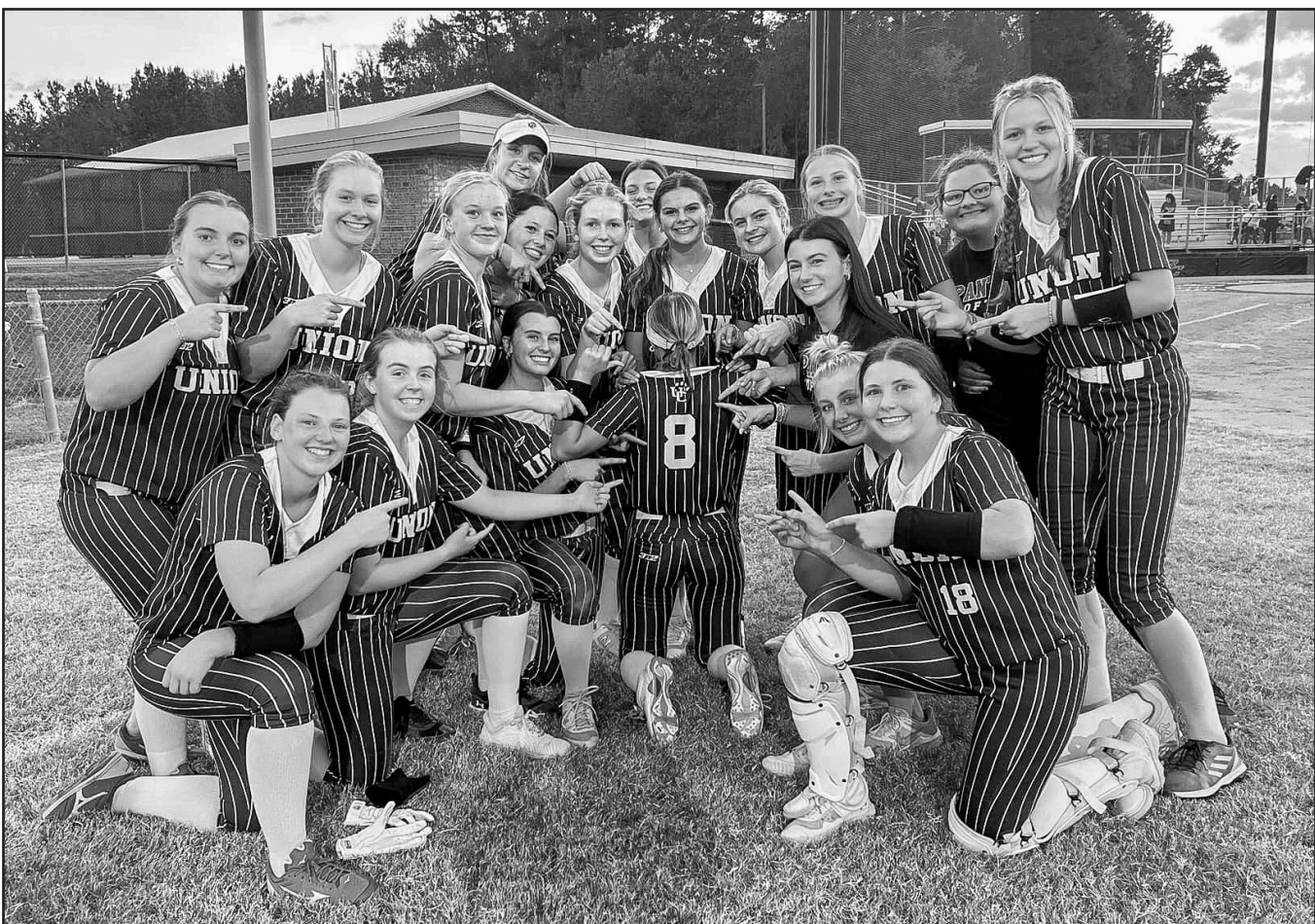
The Lady Panthers celebrate their Elite-Eight clinching victory at Burke County on Oct. 22. Union faces Region 7-AA Champion Sonoraville on Wednesday seeking to end a 7-game losing streak in the Elite Eight.

GM 1: Lady Panthers 9, Burke County 0 (5 inn) -